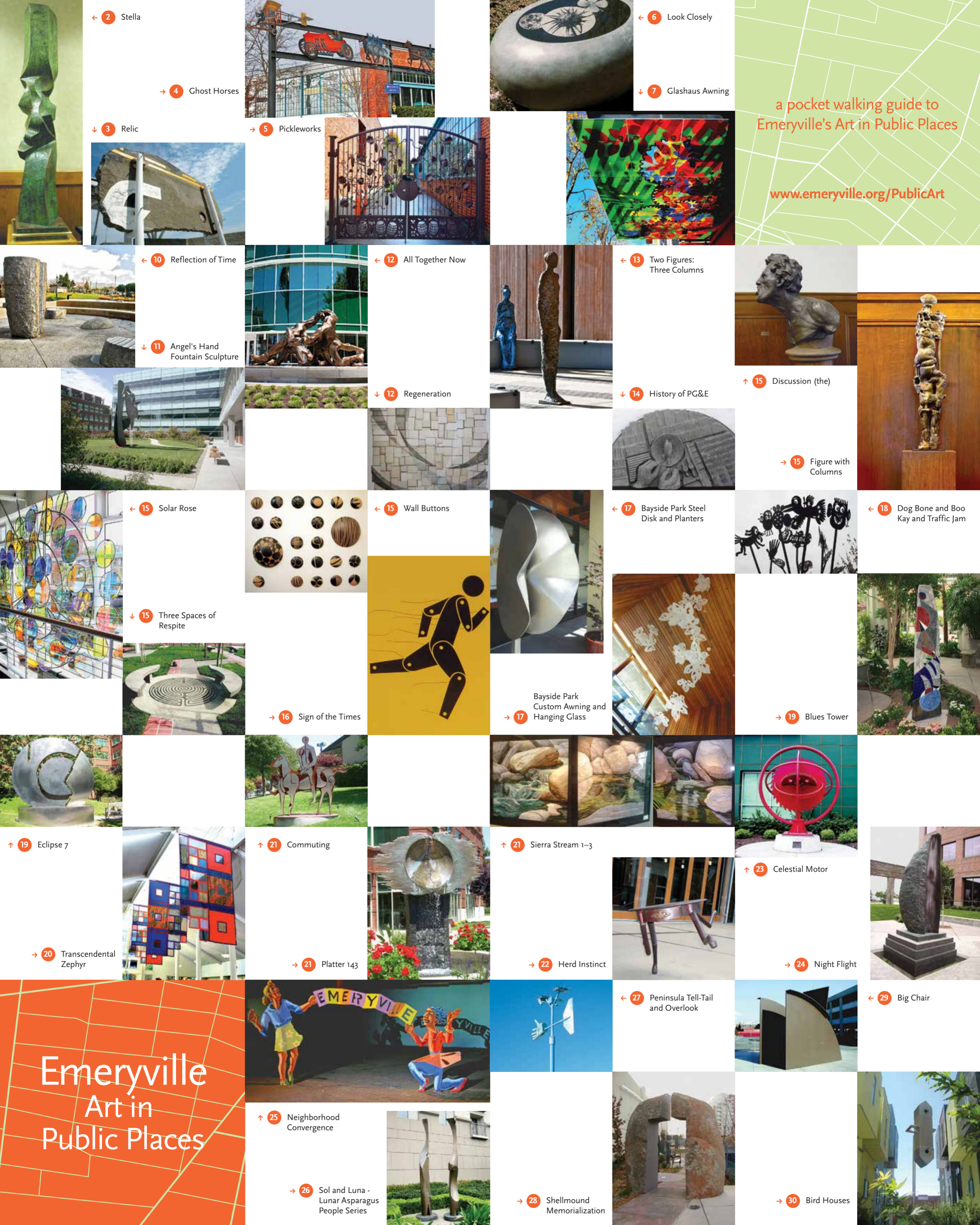
← 2 Stella